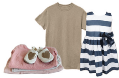
Clothing (all sizes)