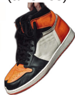
Footwear (pairs only)