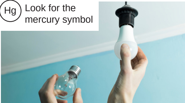
Person changing their fixture from an energy-inefficient bulb to an LED