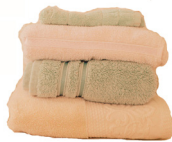
Sheets and linens